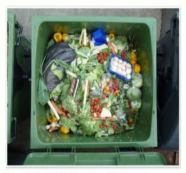
One-third of all food produced for human consumption is lost or wasted.

Forty percent of food in the United States goes to waste – this amounts to $218 billion each year spent on food that is never eaten, or an average of $1,600 a year for a family of four. The majority of this wasted food ends up in landfills, where it produces harmful greenhouse gases – 20 percent of total U.S. methane emissions come from landfills - and contributes to states and localities running out of landfill capacity.